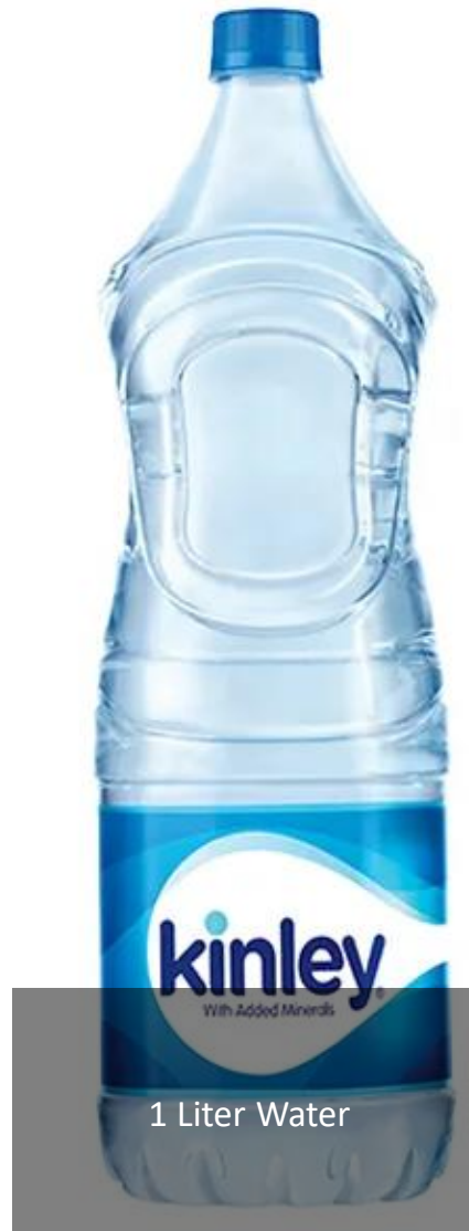
1 Liter Water