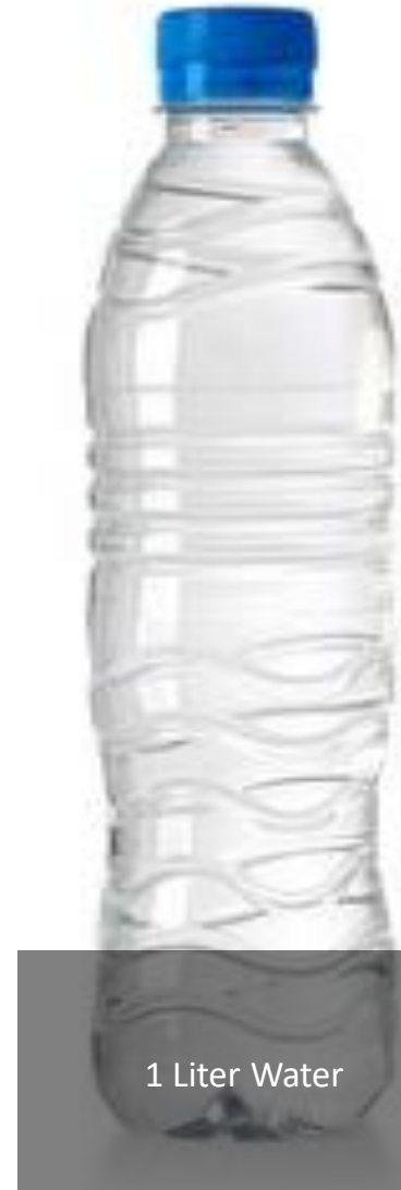
1 Liter Water